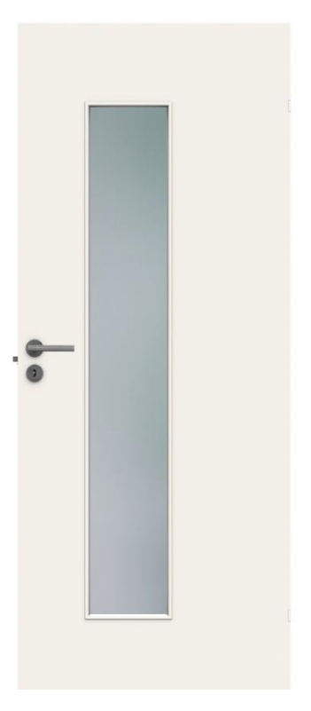
EPD HUB, HUB-0988

Published on 05.01.2024, last updated on 05.01.2024, valid until 05.01.2029.